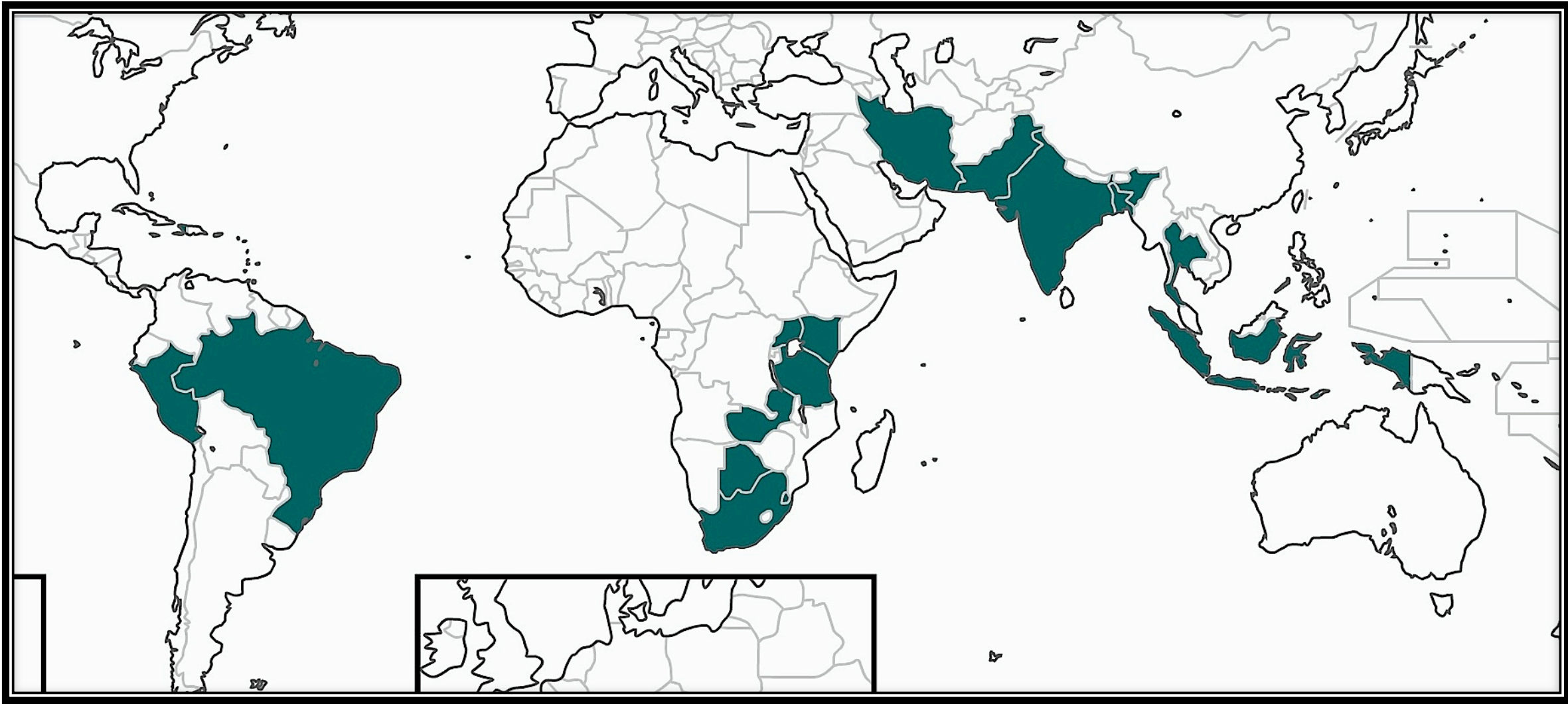
Figure 2: Case Study Locations